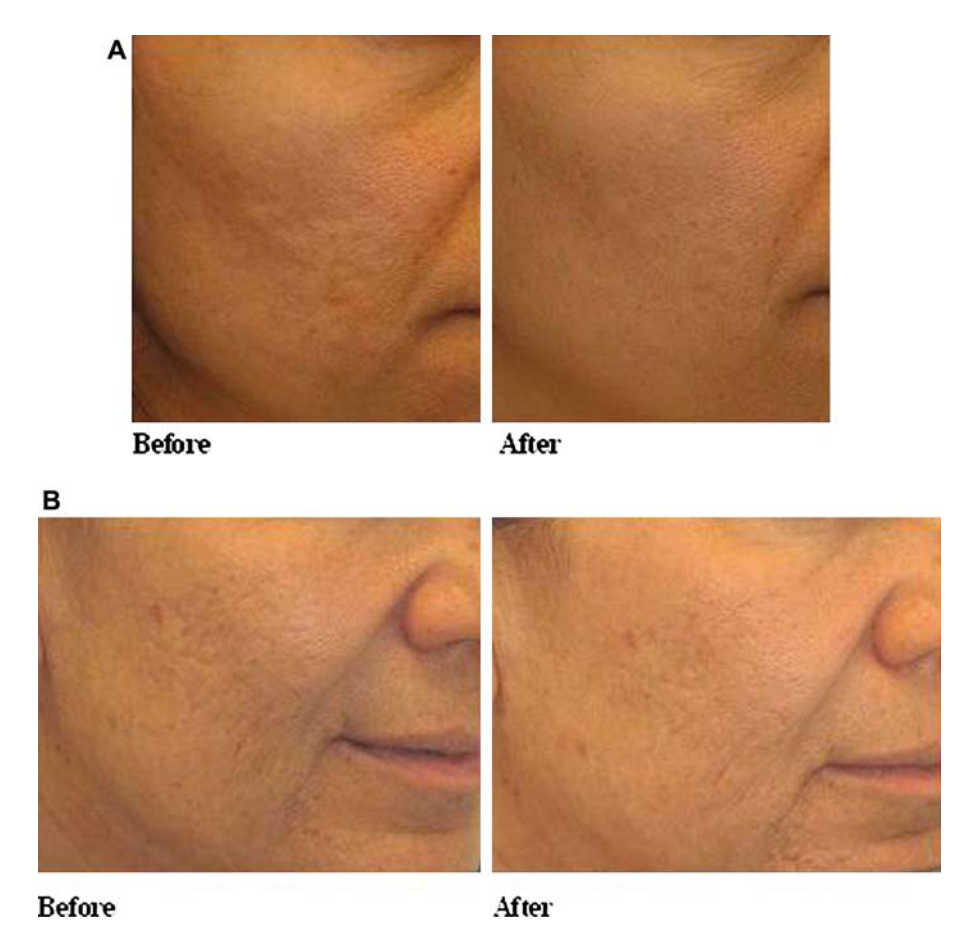
Figure 3. Treatment of acne scars. (A) Acne scars before and 1.5 months after three treatments; (B) acne scars before and 3 months after three treatments.