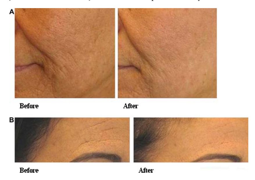
Figure 5. Treatment of facial rhytids. (A, B) Facial rhytids before and 3 months after three treatments.

improving the appearance of entire regions. Given the rapid coverage with the roller tip, which provides treatment of the full face with five passes in 10 minutes, the procedure may be amenable to the treatment of