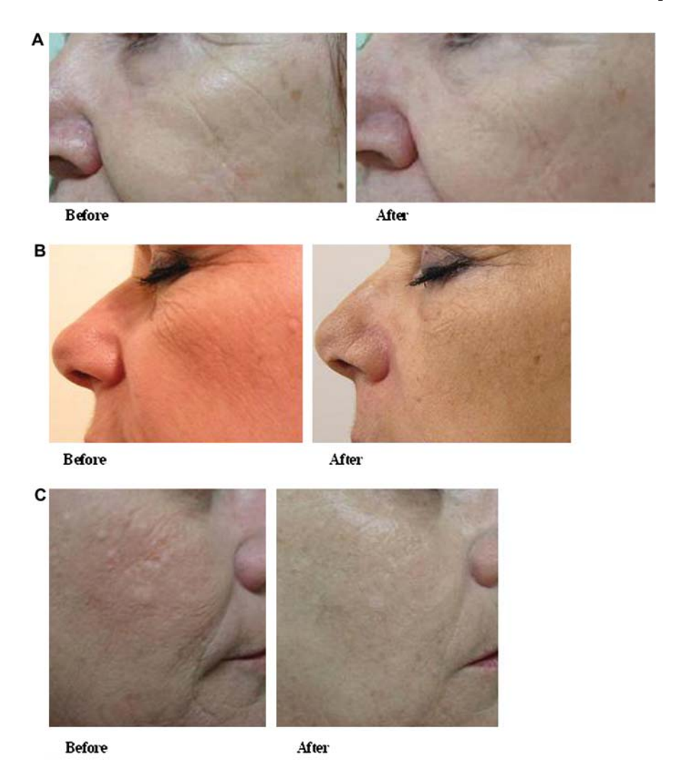
Figure 4. Treatment of facial rhytids. (A) Facial rhytids before and 1 month after two treatments; (B) facial rhytids before and 1 month after three treatments; (C) facial rhytids before and 1 month after four treatments.

option for reversing certain epidermal signs of photoaging, in addition to targeting dermal deficits. This would make the procedure appropriate not only for discrete lesions, as was assessed here, but for