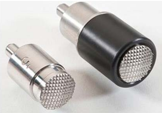
Figure 1. Pixel RF tips, showing the spicules that form the small foci of contact with the skin, in the roller configuration (left) and in stationary tips (right).

range from 100 to 150 mm in depth and from 80 to 120 mm in diameter (Figure 2). The technology improves upon conventional RF by leveraging the generation of plasma to generate focally higher con-